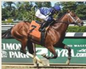
MARKING TB ($426,200) Breeding Fee: $3,500

HELD IN CONJUNCTION WITH THE 2019 NEW MEXICO BRED & SELECT FOAL IN LITERA SALE AUGUST 16-17, 2019 RUIDOSO DOWNS, NM