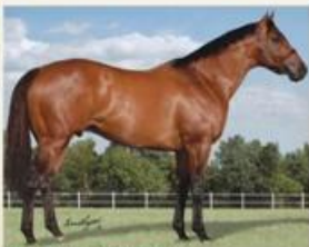
ATTILA'S STORM TB ($534,983) Breeding Fee: $4,000

Doubleline Farm 5208 S. SUMMIT HORSE LANE • HOBBS, NM (575) 437-4714 • DOUBLELINEFARM@HOTMAIL.COM WWW.DOUBLELINEFARM.COM