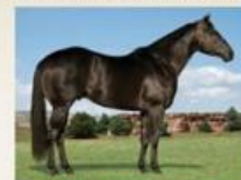
JET BLACK PATRIOT SI 110 ($476,921) • Breeding Fee: $4,000

Double LL Farm PO BOX 40 • BOSQUE, NM • WEL, MCKENZIE • (505) 864-0485 LLFARM@G.COM WWW.DOUBLELLFARM@G.COM