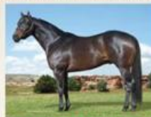
A PASSION FOR FLASHN SI 91 ($282,976) • Breeding Fee: $2,000

QUARTER HORSES' SERVICE TO BE AUCTIONED BEFORE THE SALE ON AUGUST 17