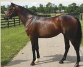
ABSTRACTION TB ($36,945) Breeding Fee: $3,500

AAA Ranch 1713 W. WASHINGTON • ANCHERO, NM INQUIRES TO: FRED ALEXANDER (815) 539-2178 OFF (815) 539-0040 • WWW.AAARANCH.COM • ANKERSTANCH@AOL.COM