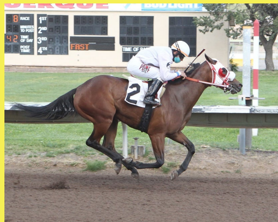
MJ Farms' Donelli, a graded stakes-winning