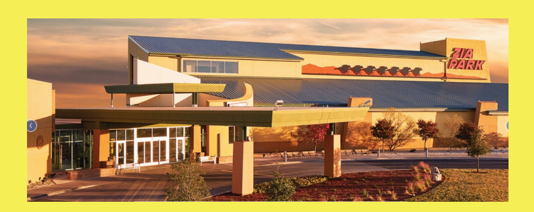
Zia Park Stall Applications are due August 6th

Do not forget that all owners running a NM Bred on the track must be an active member of the NMHBA within 90 days of placing 1st, 2nd, or 3rd. If you do not comply you will forfeit your incentive awards. Tell your friends and continue to pass the word along!