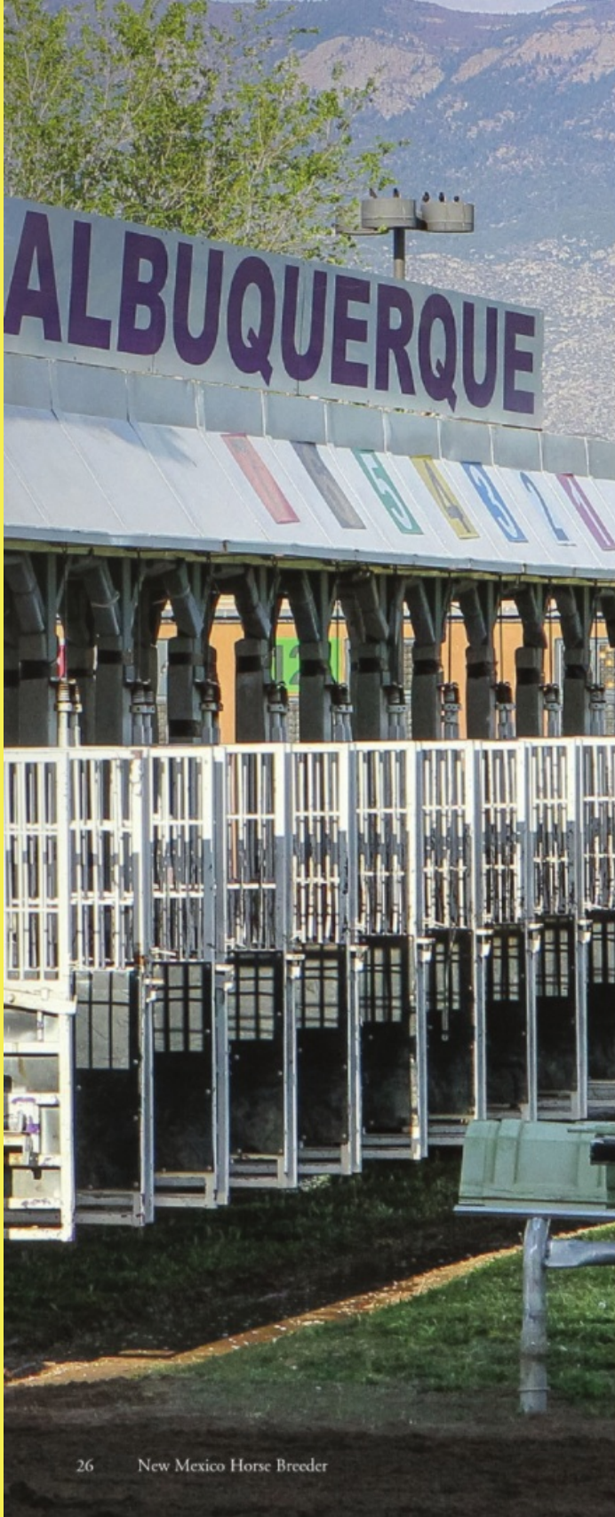
26 New Mexico Horse Breeder