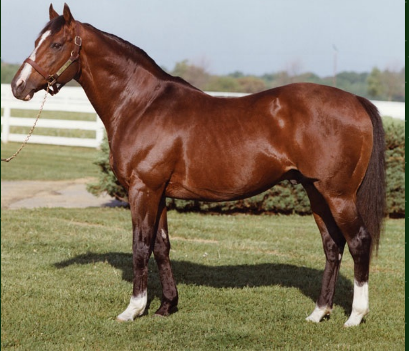
Northern Dancer (TB)