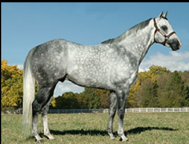
QH Stallion of the Year Big Daddy Cartel