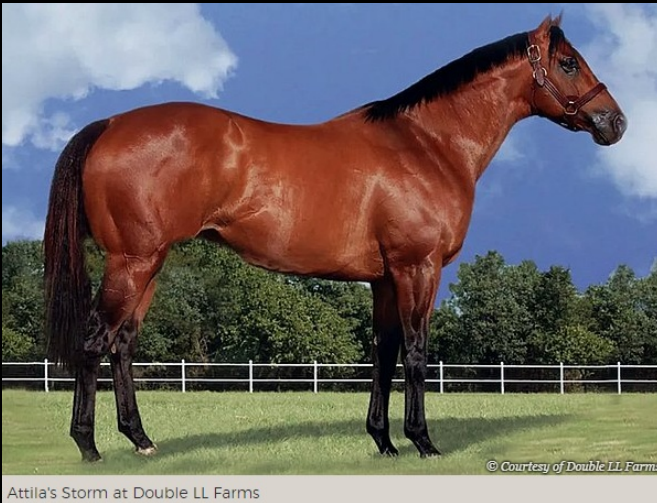
TB Stallion of the Year Attila's Storm