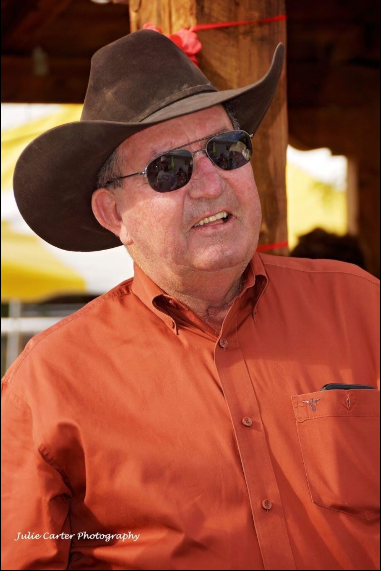
Julie Carter Photography