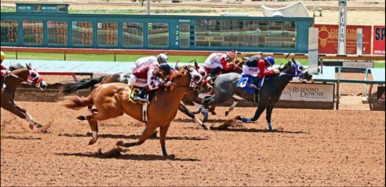
Ricanelo wins 2022 Mountain Top Futurity Trial