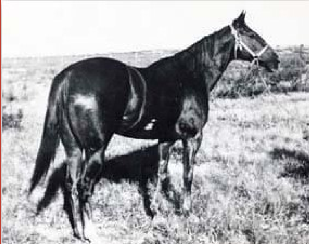
Shue Fly