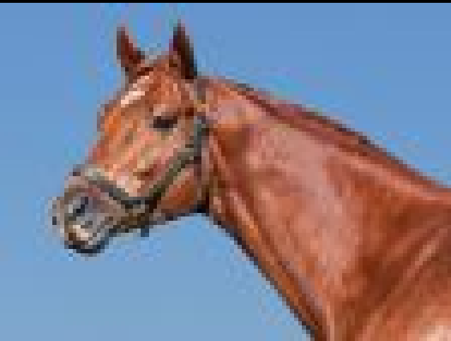
TB Kentucky Wildcat