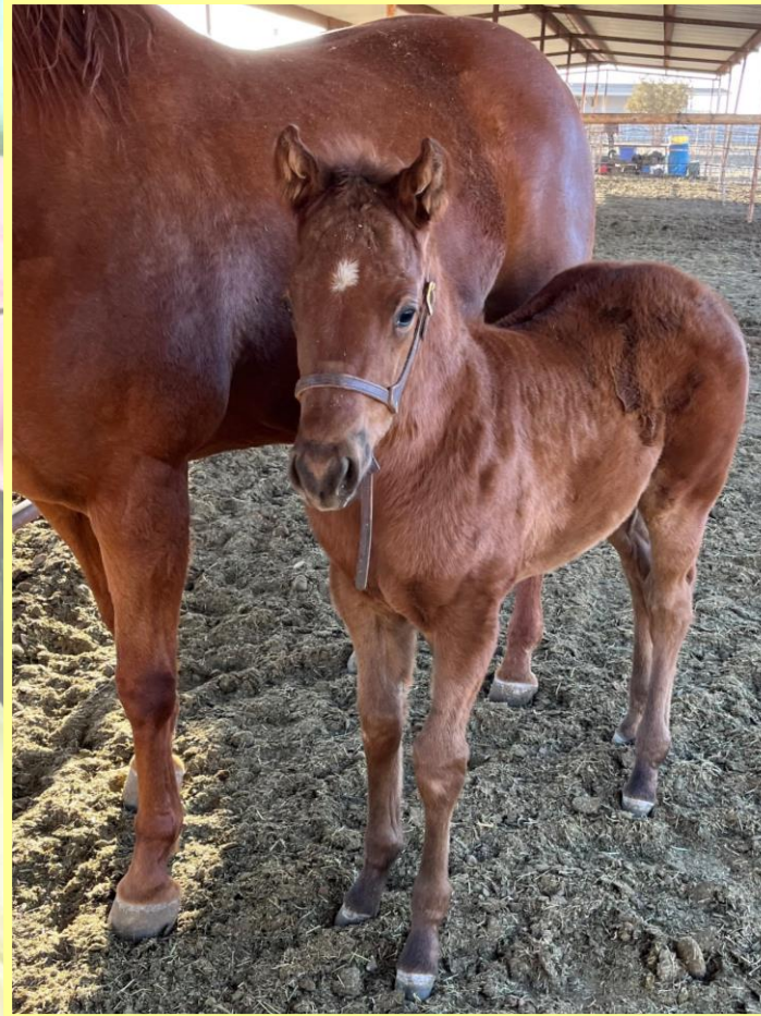
2023 filly by Suspicious Interest – The Perfect Eagle Owner La Feliz Montana Ranch Half-sister to One Perfect Lady