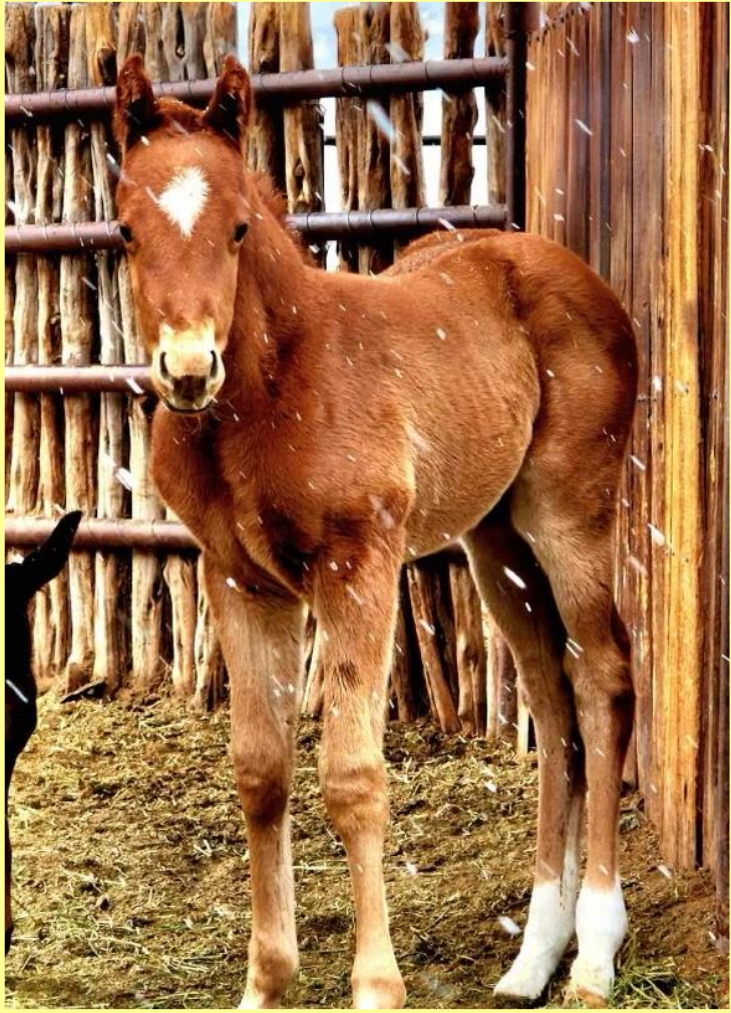
2023 foal by Woodbridge – Lucky Flash