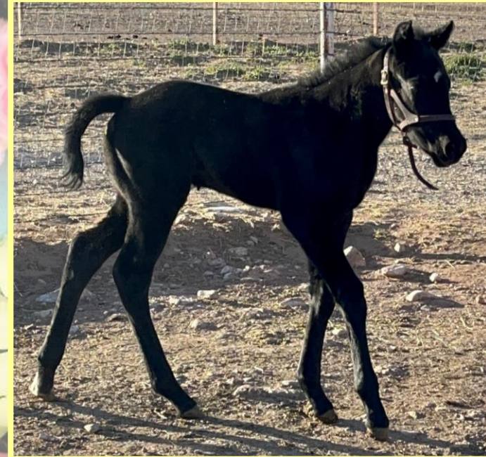
2023 colt by Suspicious Interest – Panther Not A Kitty Owner La Feliz Montana Ranch