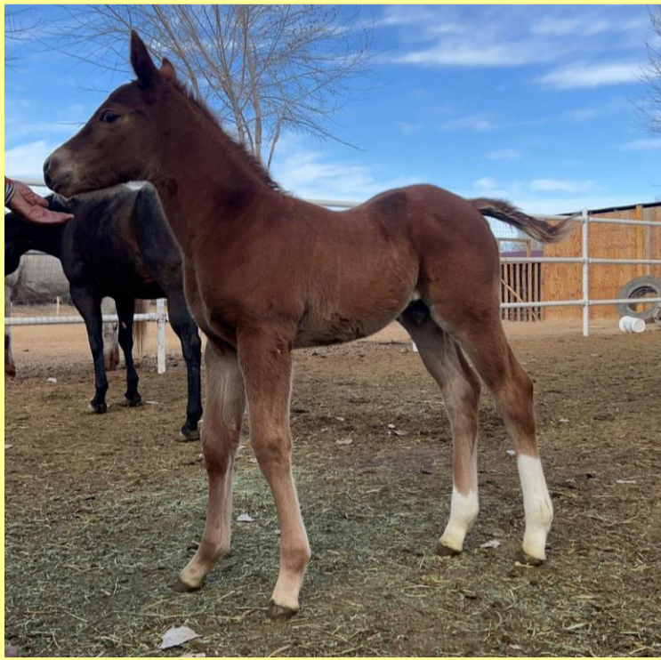
2023 colt by Big Daddy Cartel – Sukis Super Chic Owner Meluking Ranch