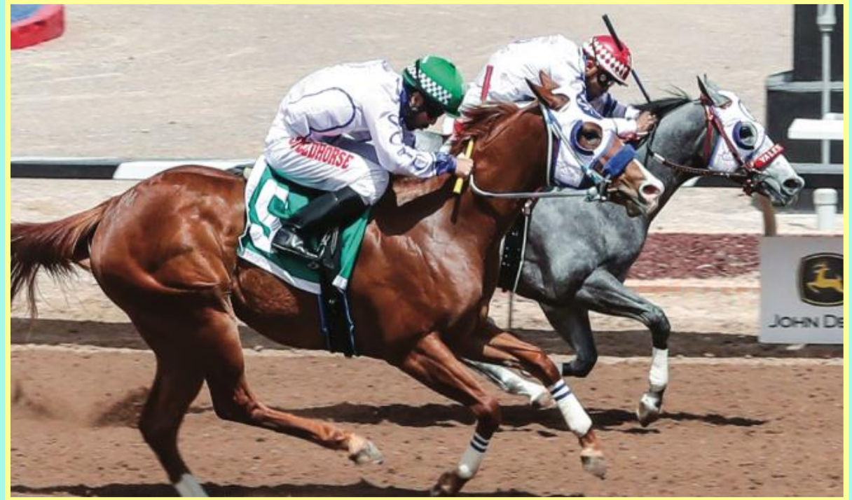
2022 Spring Fling winner Cartel Racer

“A dozen state-bred 2-year-old Quarter Horses, including two also-eligible entries, are entered in Saturday’s 300-yard, $50,000 New Mexican Spring Fling Stakes (R) at Sunland Park.