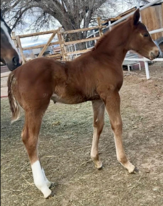
2023 colt by Big Daddy Cartel – Sukis Super Chic Owner Meluking Ranch