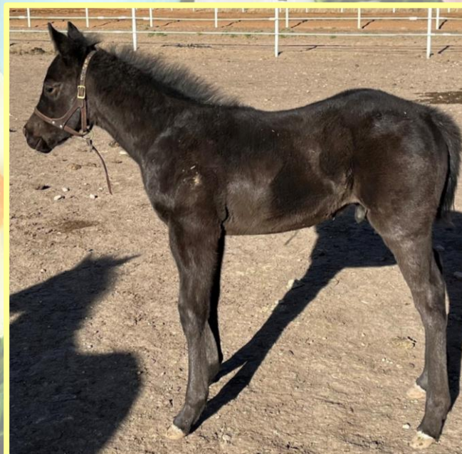
2023 colt by Suspicious Interest – Javys Brown Sugar Owner La Feliz Montana Ranch