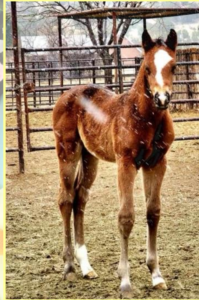
2023 foal by Big Daddy Cartel – Theyre Be An Answer