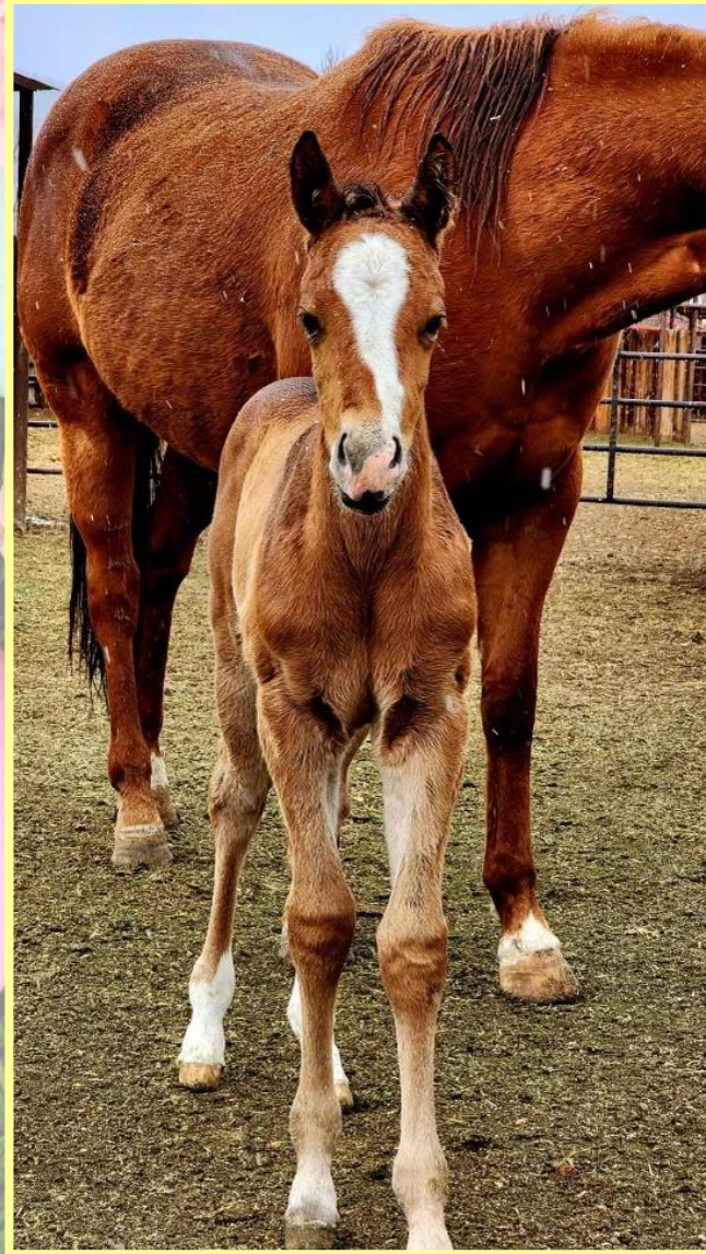
2023 foal by Docs Best Card – Tempt Me Honey