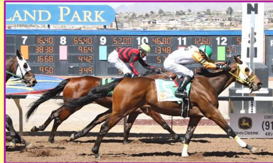
Article about New Mexico Breeders' Derby will be in the next newsletter