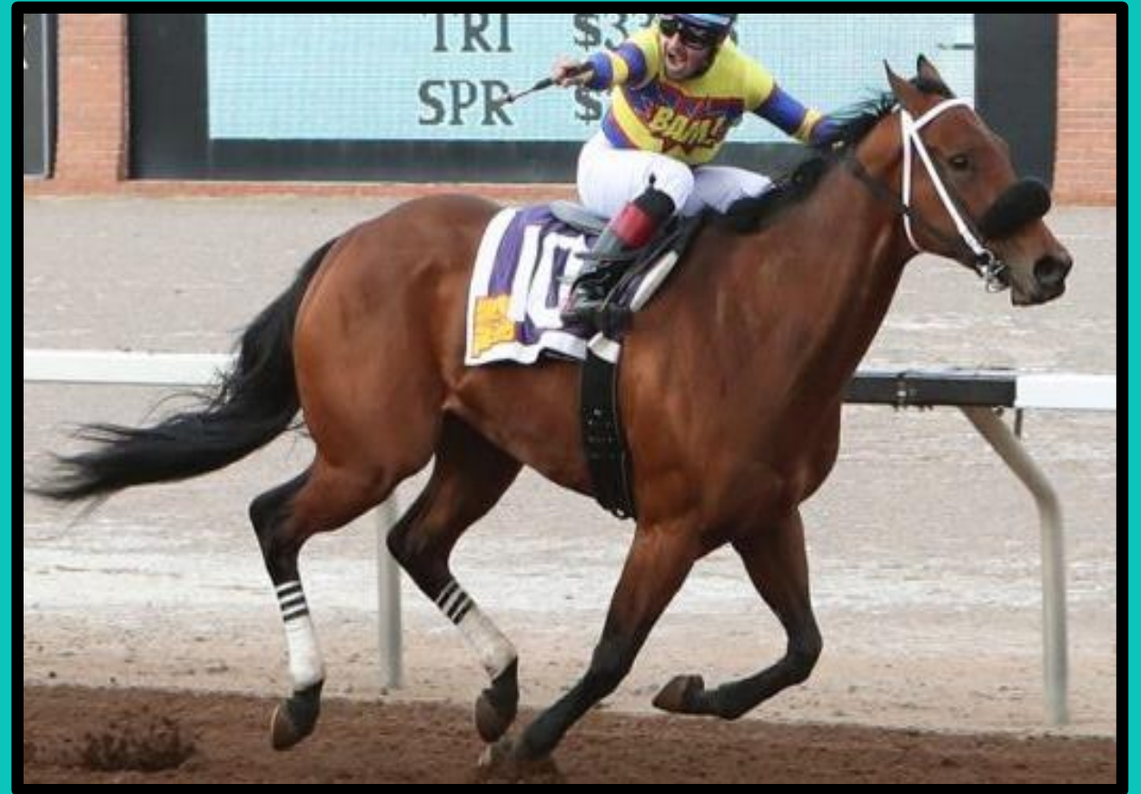
BIKINI TIME – 2023 NM Racing Commission Handicap