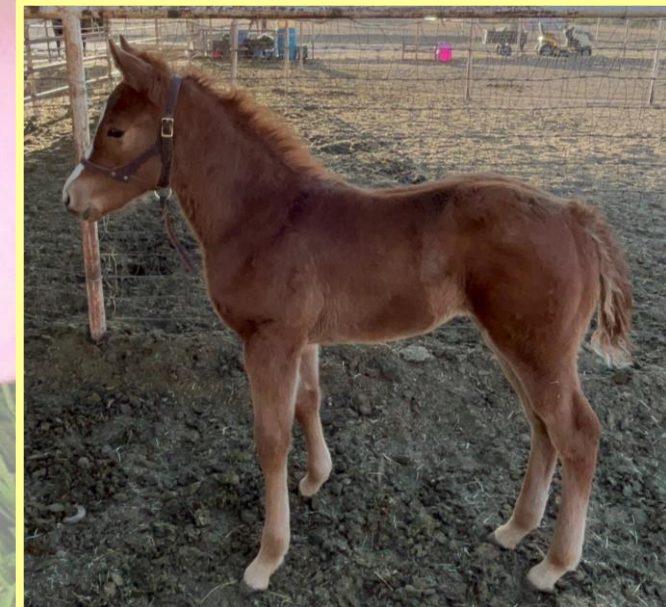
2023 filly by Suspicious Interest – Queen Yanet Owner La Feliz Montana Ranch