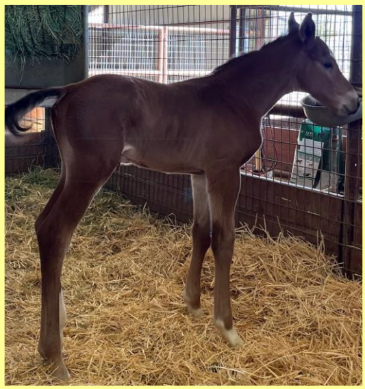
2023 colt by American Anthem – Gift Card Owner Box K Racing