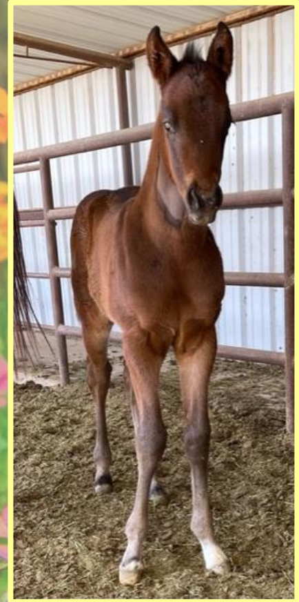
2023 colt by Comfort - Empressive Humor Owner Dilly Dilly Racing