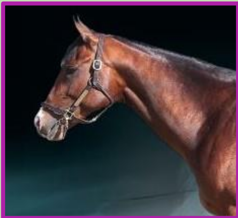
Sway Away (TB)