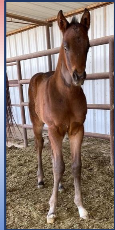
2023 colt by Comfort - Empressive Humor Owner Dilly Dilly Racing