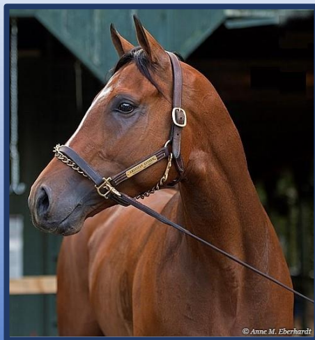
American Anthem (TB)