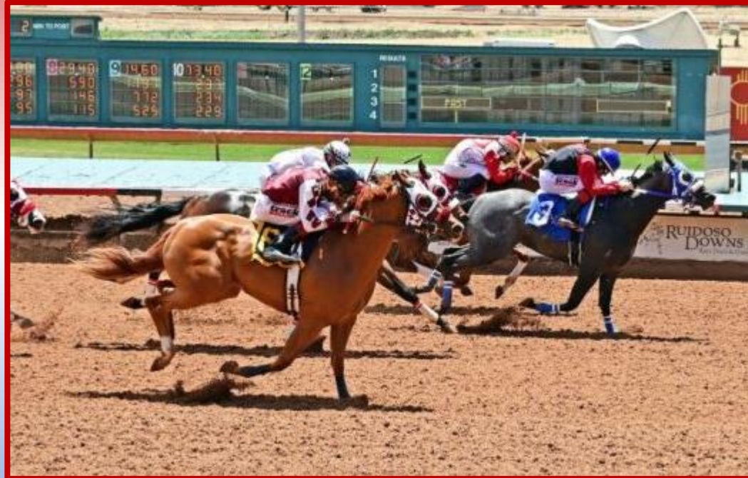
2022 fastest qualifier to Mountain Top QH Futurity RICANELO