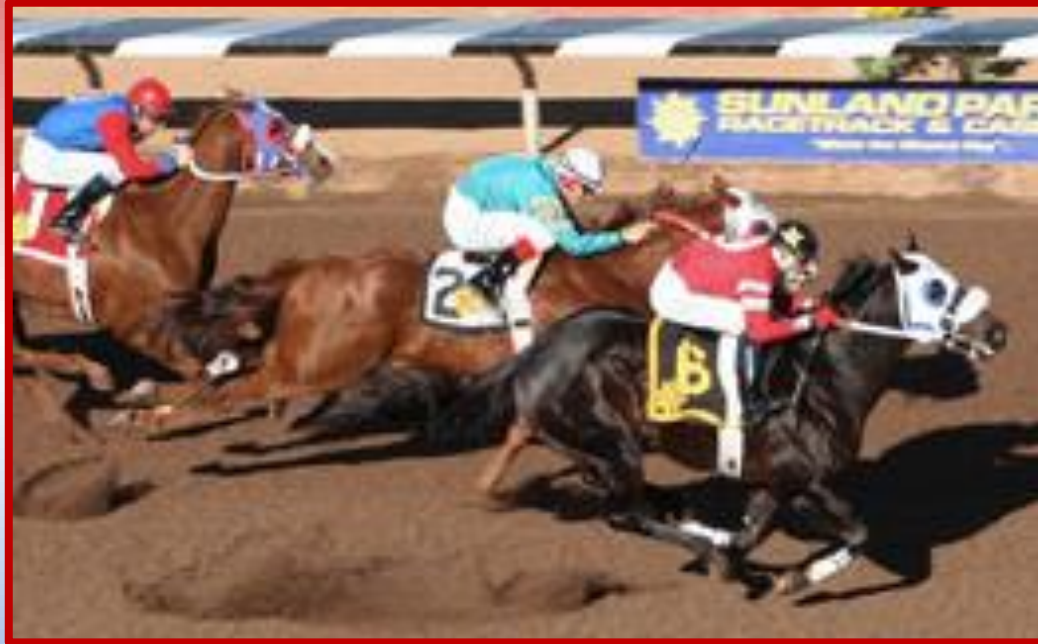
First Moonflash winning the 2008 Jess Burner Stakes at Sunland Park