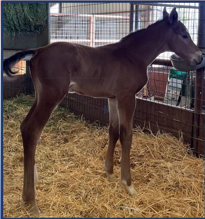
2023 colt by American Anthem – Gift Card Owner Box K Racing