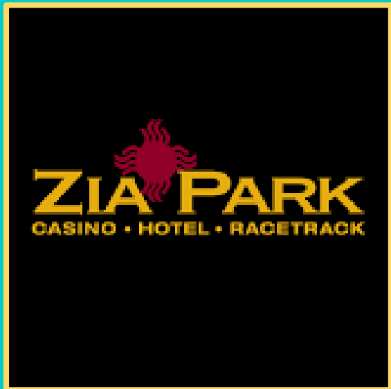
Zia Park website