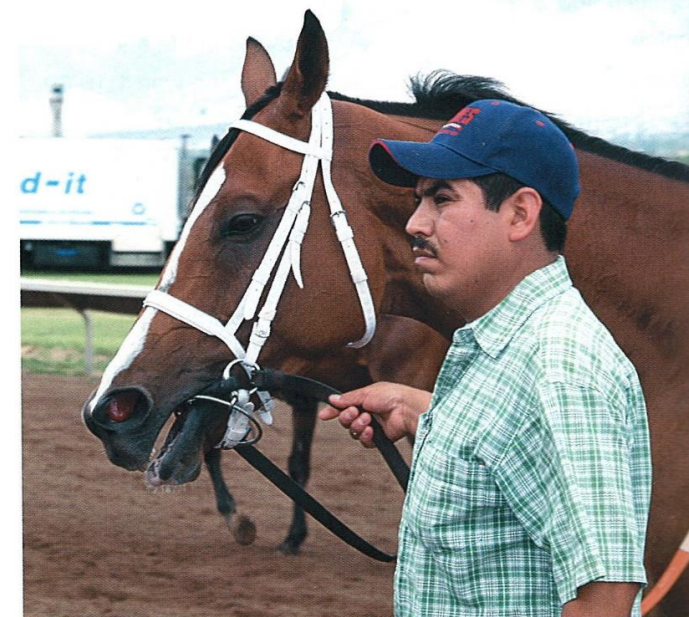
New Mexico Horse Breeder