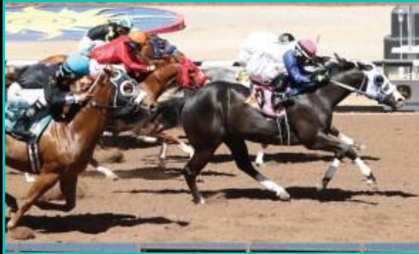
BIGG SHADES OF GRAY - 2023 New Mexican Spring Fling

The cut-off for award checks this year is the end of State Fair, so any races run after State Fair will be on NEXT year's checks!