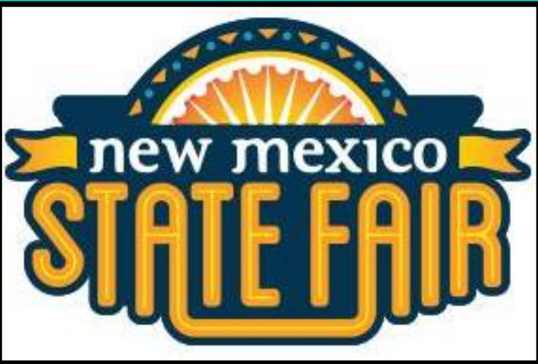
Downs At Albuquerque website