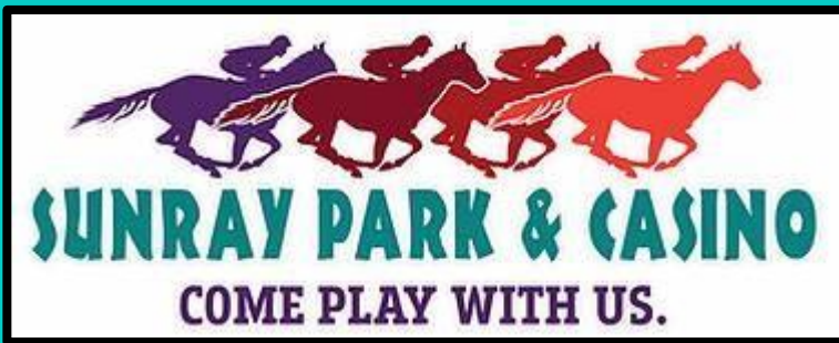
SunRay Park website