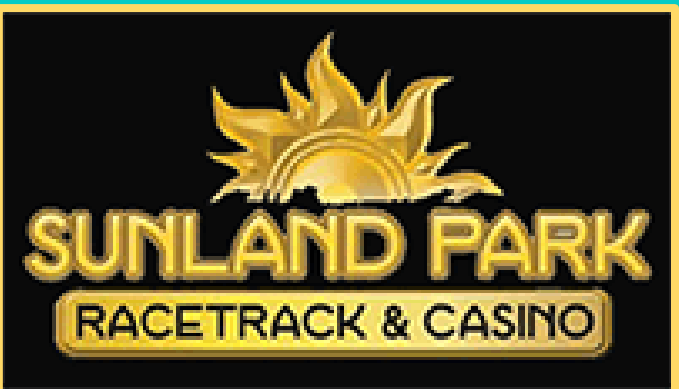
Sunland Park website