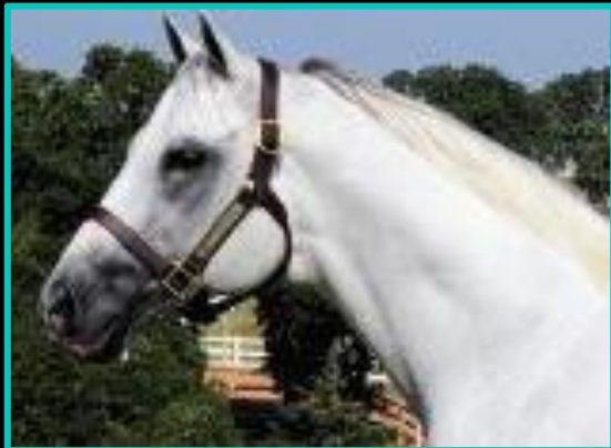
Chicks Regard (QH)