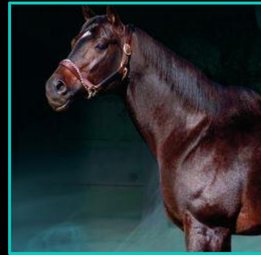
Shame On Charlie (TB)