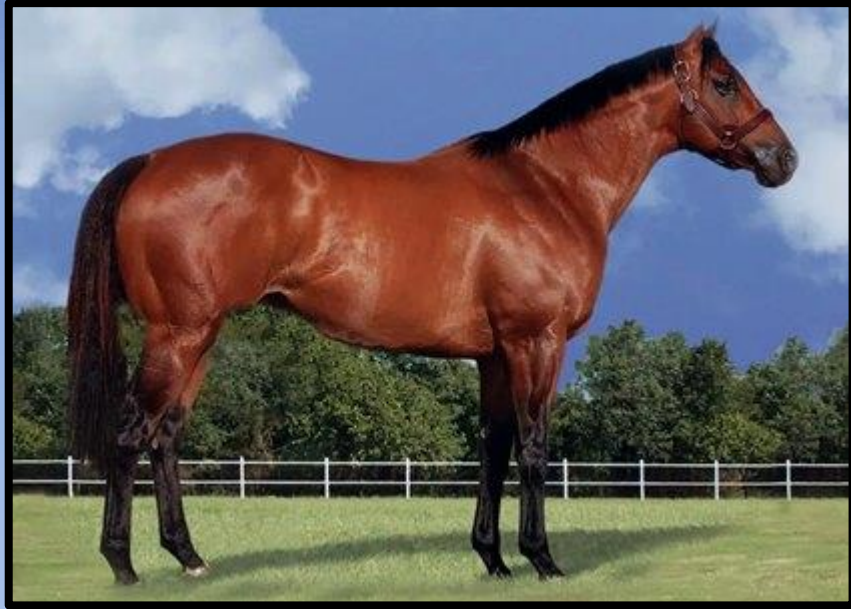
ATTILA'S STORM (deceased)

The Stallion Update Forms were mailed September 1, 2023.