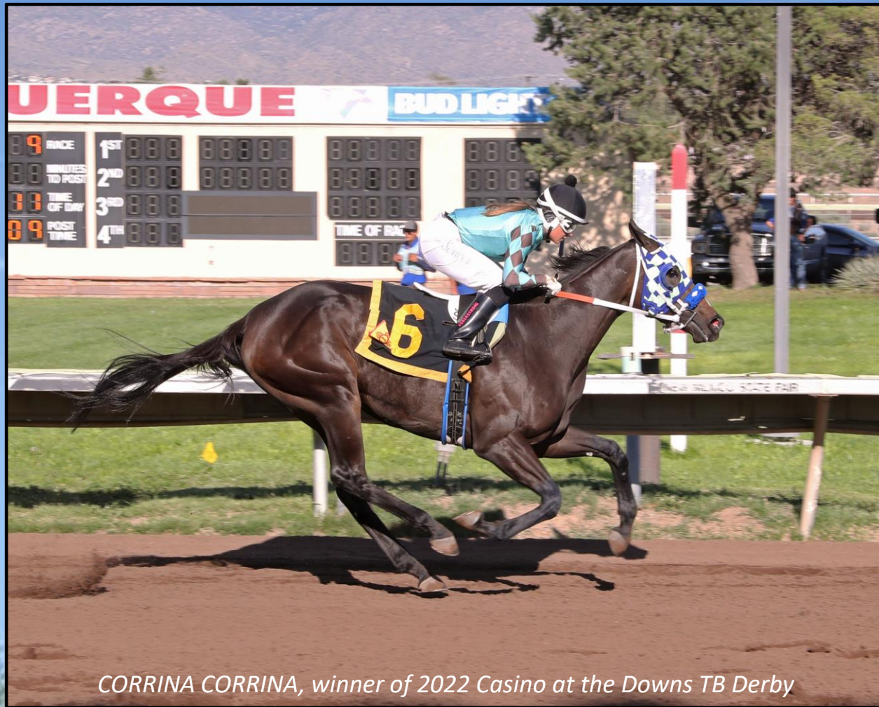
CORRINA CORRINA, winner of 2022 Casino at the Downs TB Derby