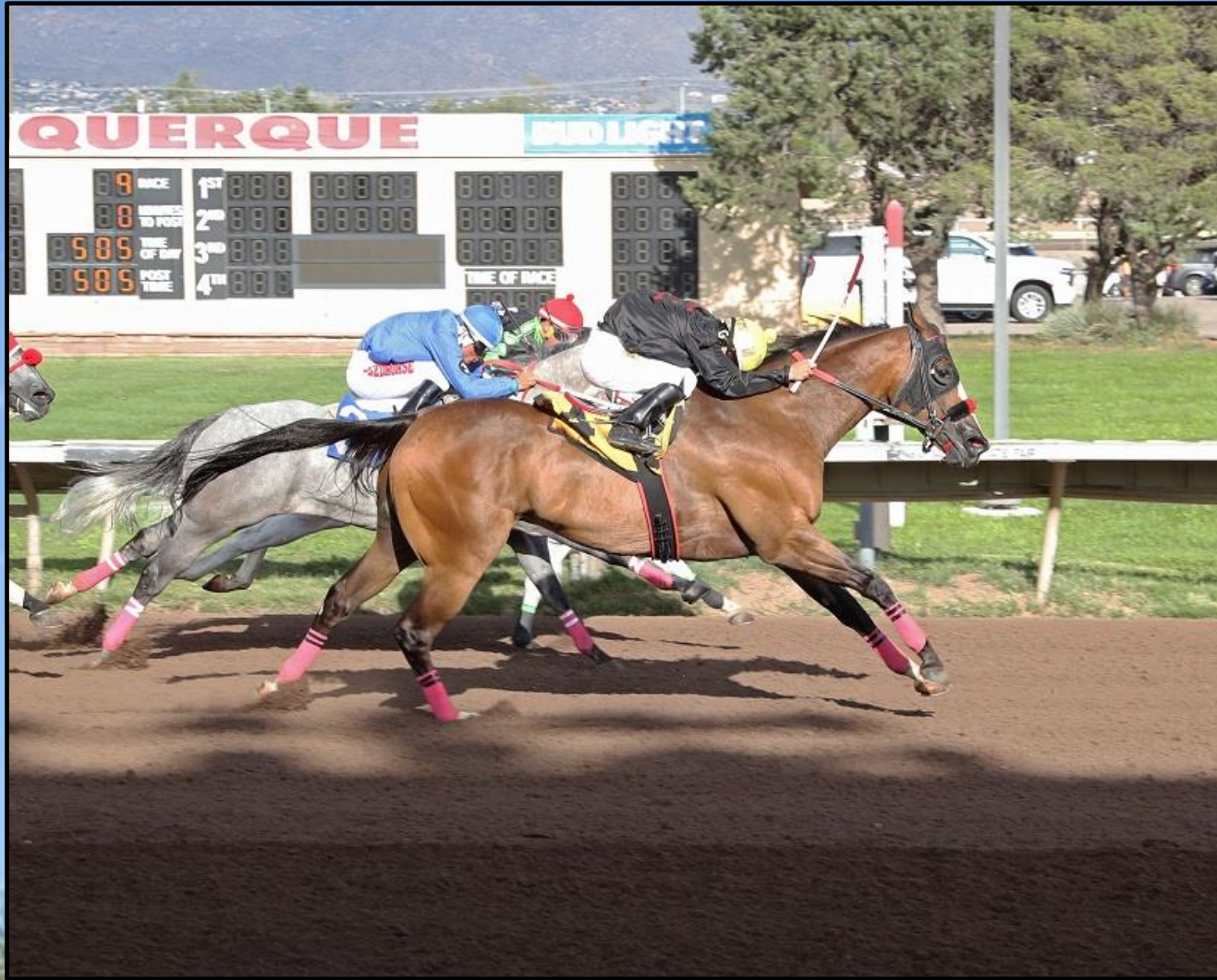
NO MIRES A LA LUNA, winner of 2022 First Moonflash QH Maturity