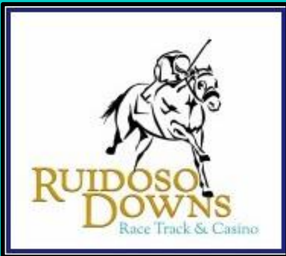
Ruidoso Downs website