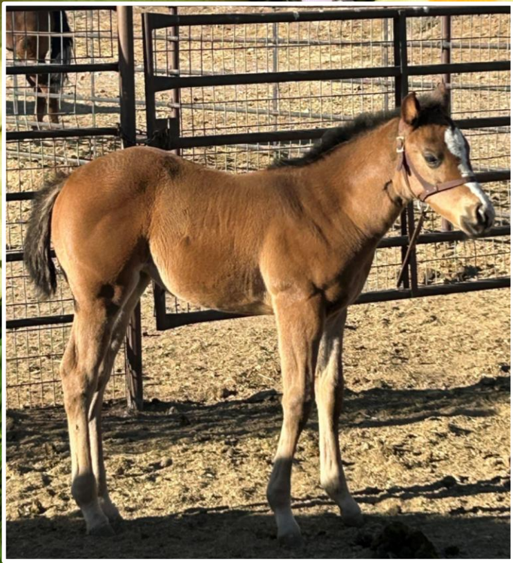
2024 Big Daddy Cartel - Miss Ravens Wood