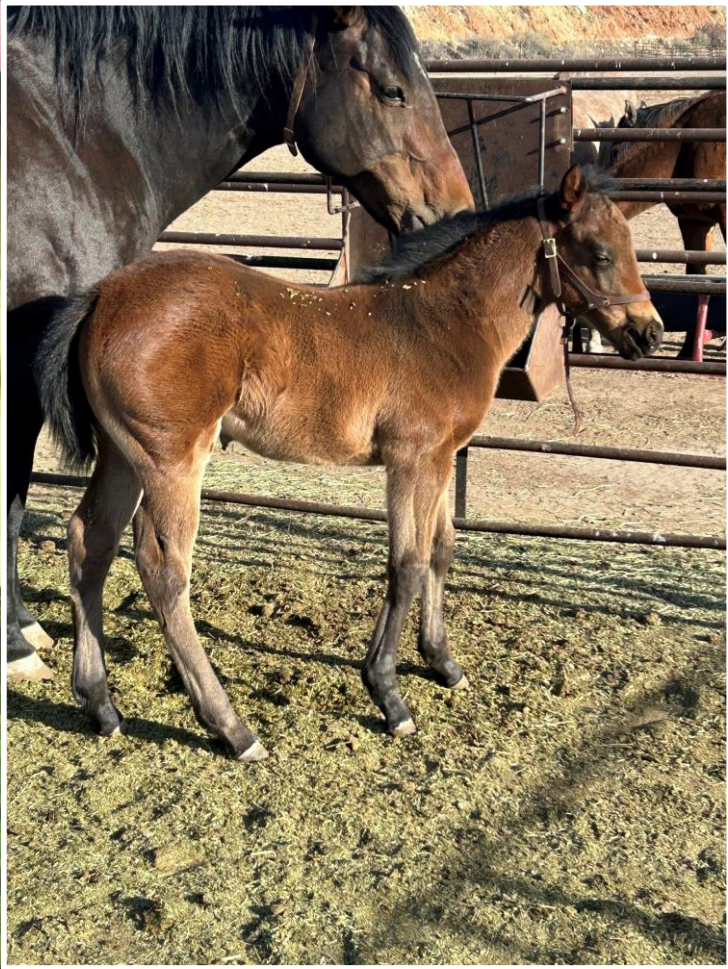
2024 Bogart - T Tornado Seis