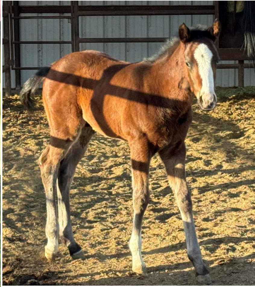
2024 Colt by Runaway Ghost - Kiss For Mom Owner S & G Racing, LLC