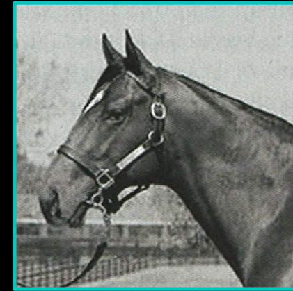
Embrace The Storm (TB)