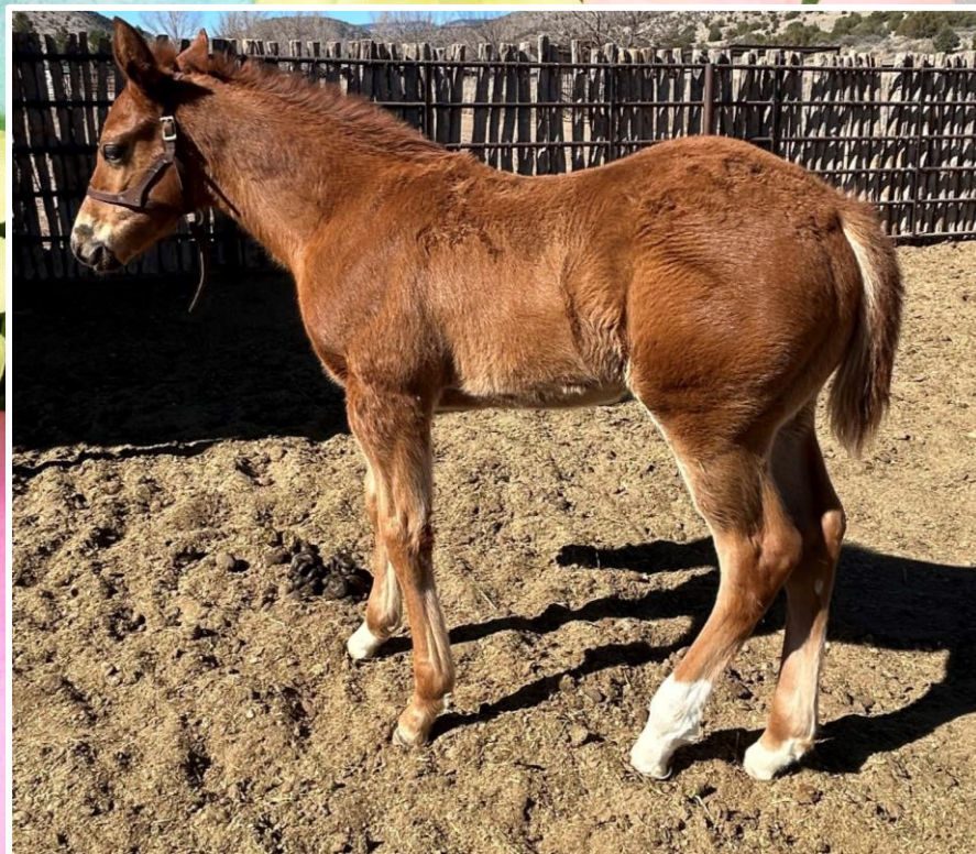
2024 by Bogart - Gratifying