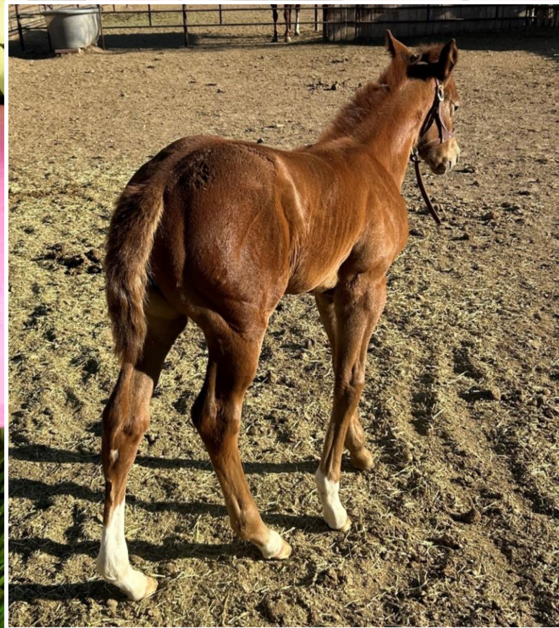
2024 by Elmer - Rime Lucky Girl