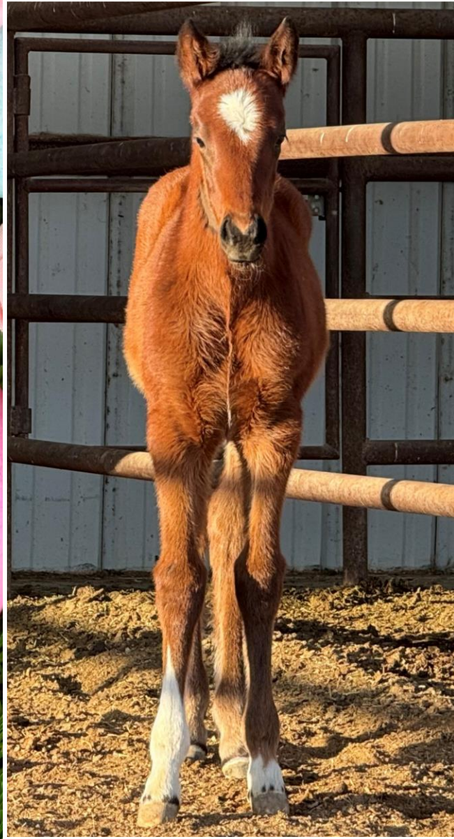
2024 filly by Marking-Plenty of Joy Owner S & G Racing, LLC