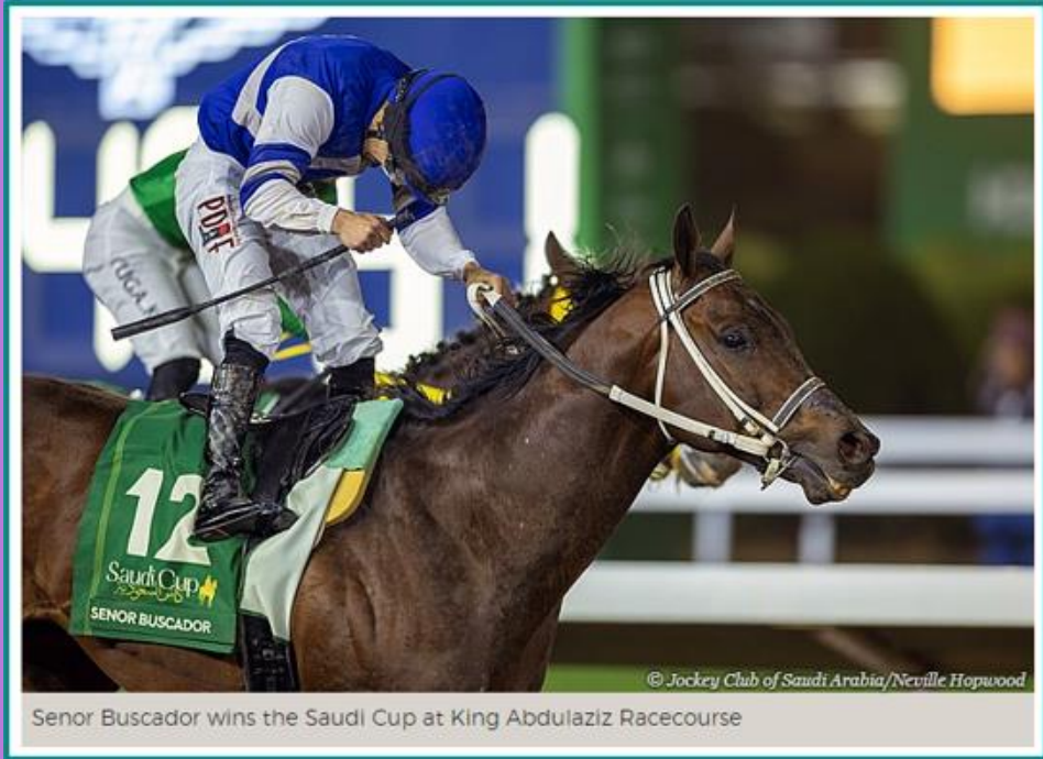
Senor Buscador wins the Saudi Cup at King Abdulaziz Racecourse