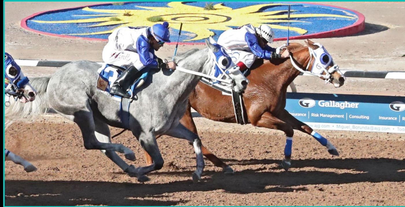
OVER DA EDGE winning the 2024 Sunburst Stakes at Sunland Park