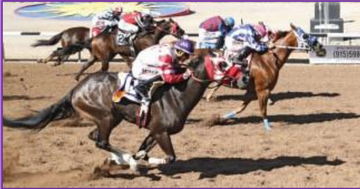
2023 NHMBA QH Stake winner WOODYS STORM

NMHBA Quarter Horse Stake RGII 3 Year Olds 400 yards $100,000 Guaranteed Saturday, April 6, 2024