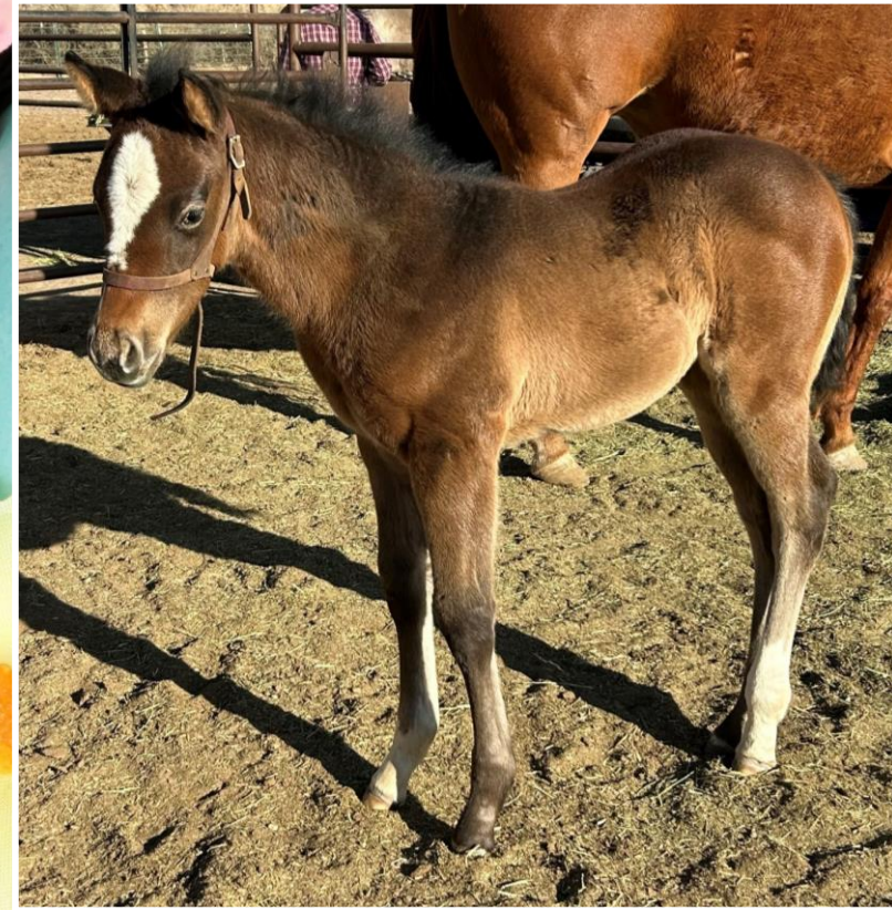
2024 Big Daddy Cartel - Tempt Me Honey