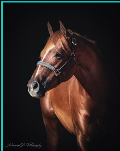
A TELLER JESS (QH)