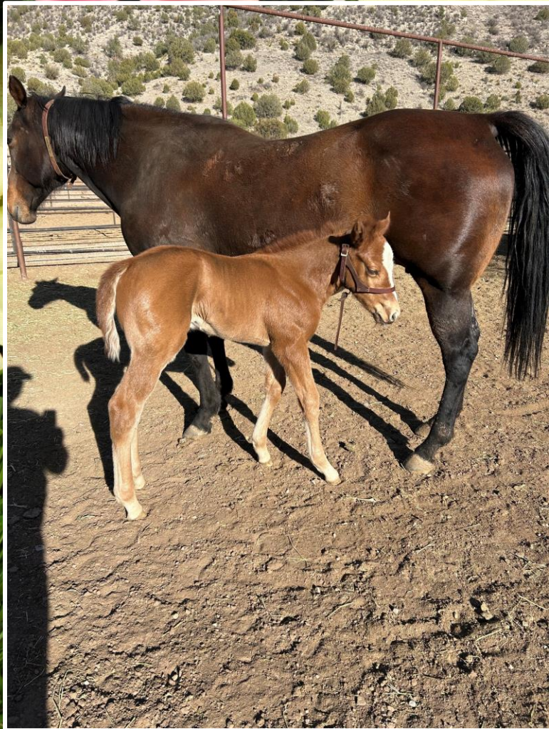
2024 by Eye Am King - Miss Ravens Wood