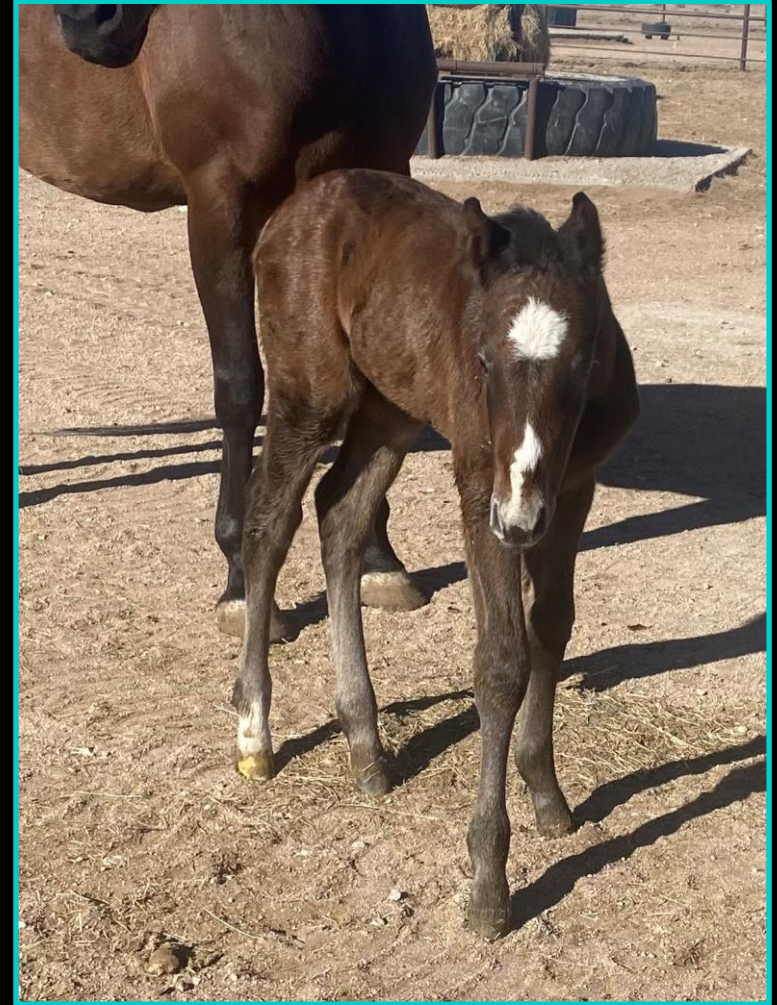
2024 colt Woodbridge - Hollyn Bootie