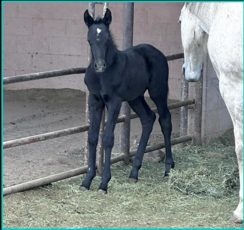
2024 colt by Jet Black Patriot - Fireball Flash Owner Dan Delaney