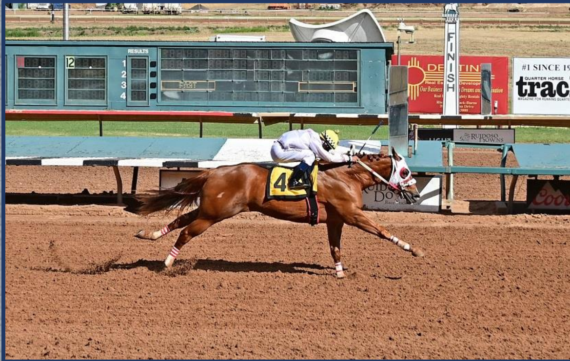
Pick Your Pour winning the 2022 Mountain Top Futurity

“Making his first official start since February 17, Pick Your Pour sped to a wire-to-wire victory in the June 2, $50,000 Jess Burner Stakes (R) for New Mexico-bred Quarter Horses at Ruidoso Downs.