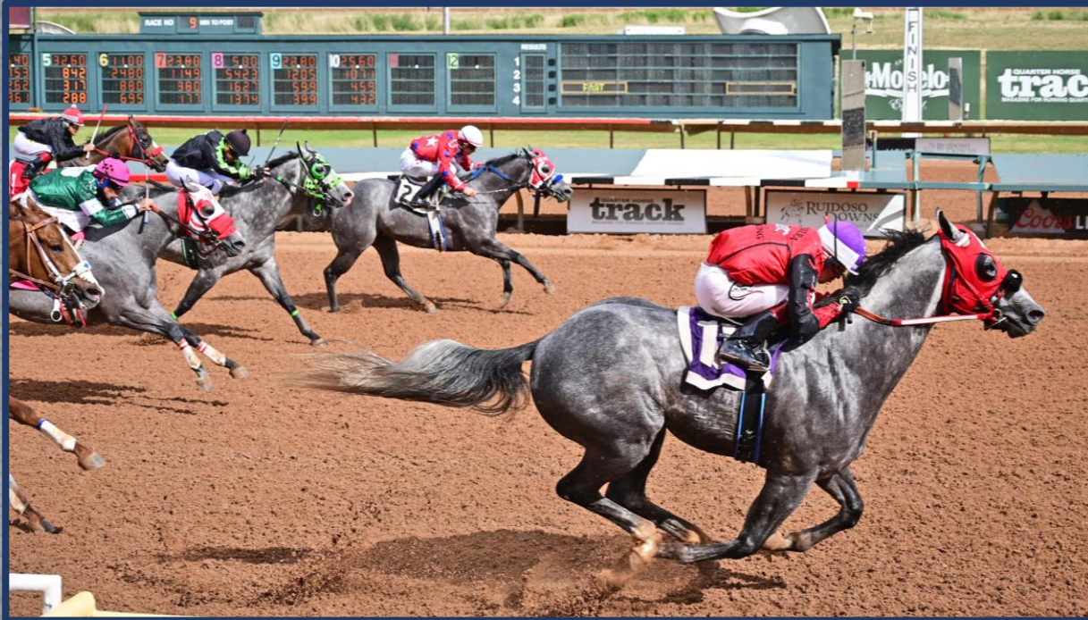
2023 Jess Burner Stakes winner BIG CRUSH BB