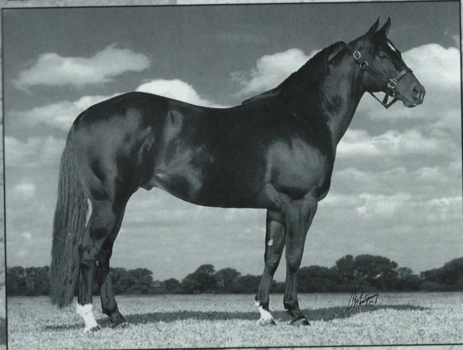
(Streakin Six - Our Third Delight by Reb's Policy)

New Mexico Horse Breeder Stallion Issue 2002