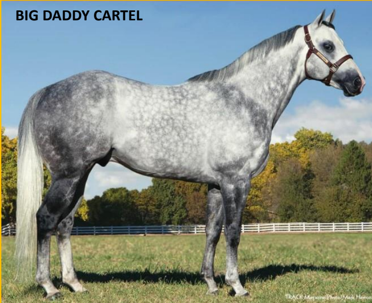
BIG DADDY CARTEL