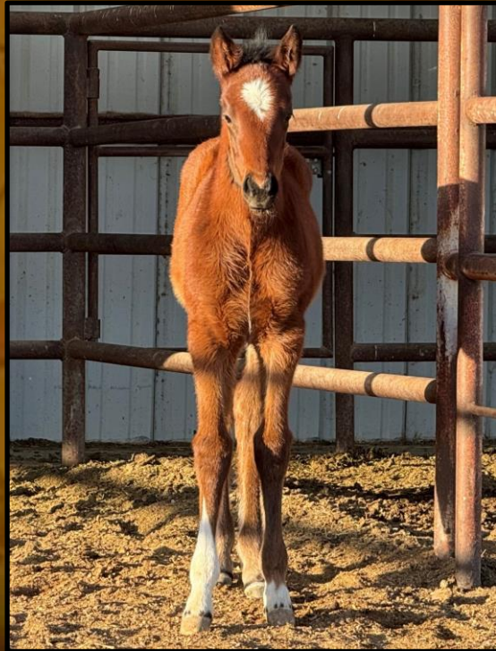
2024 filly by Marking - Plenty of Joy Owner S and G Racing

ALL HORSES AGE JANUARY 1 ST AND THE FEE GOES UP!