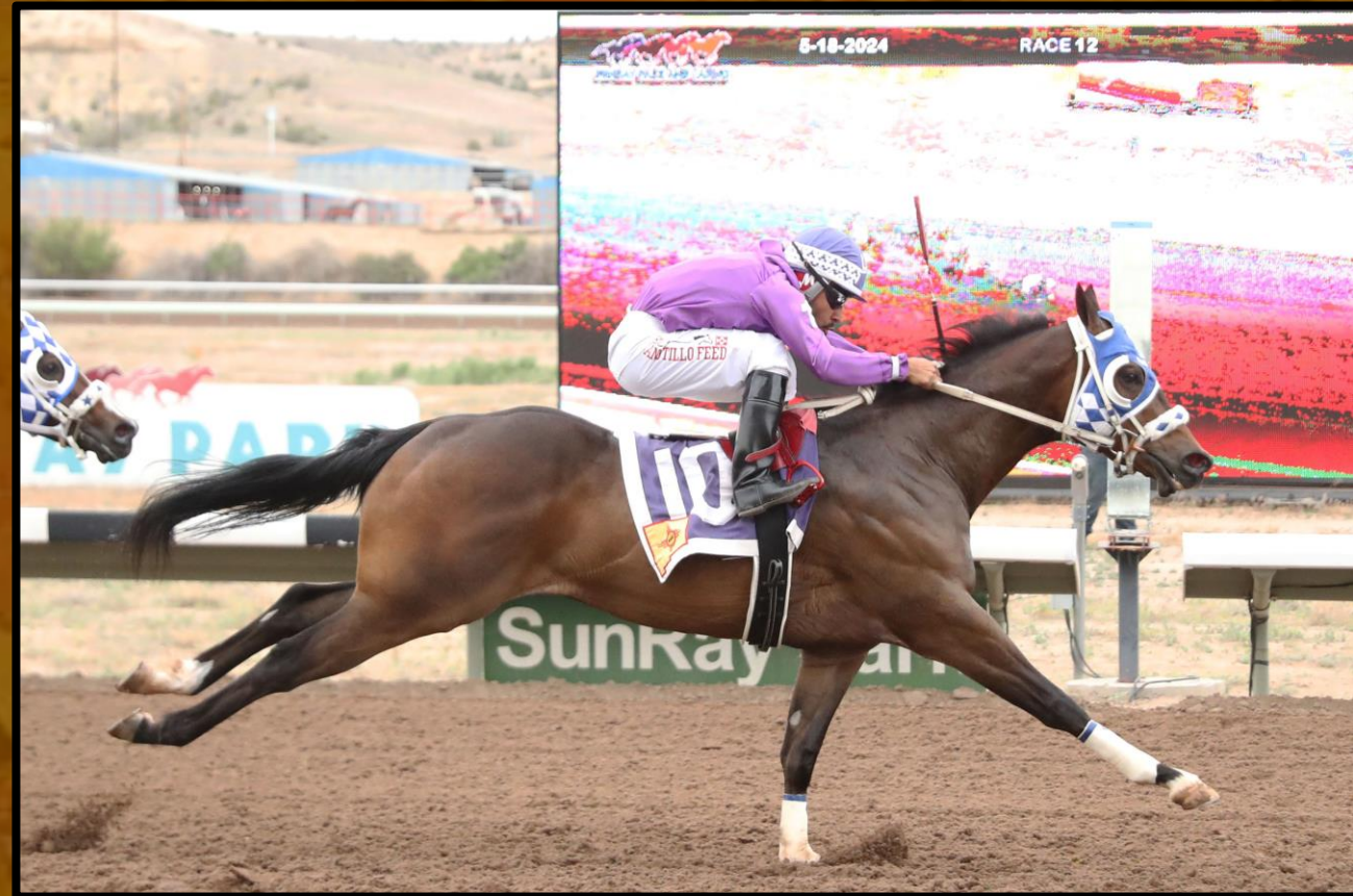
PAVEL winning the 2024 NM Breeders Futurity at SunRay Park